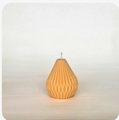
12 Diamond pear (6.5 x 8cm)