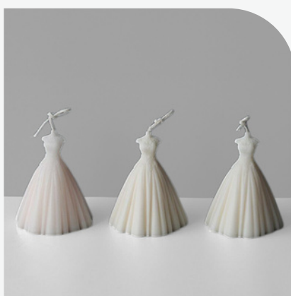
13 Wedding dress (7 x 8.5cm)