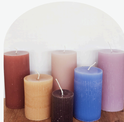
05 Roman pillar candle

*Candles shown are in Snow | Royal blue | Peach | Sky