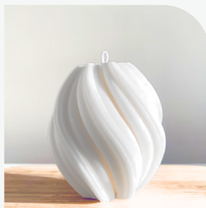
11 Tapered Roman (7 x 7.5cm)