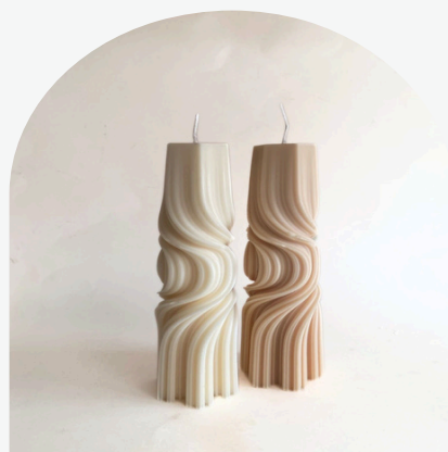
13 Tidal wave (5 x 13.5cm)