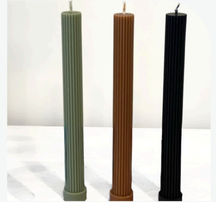
03 Roman dinner (3.5 x 27cm)

*Candles shown are in Gold | Snow | Lilac | Peach