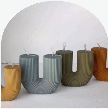
06 U-shape candle (8.5 x 8.5cm)