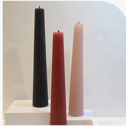
07 Tapered Roman candle

*Candles shown are in Gold | Dusty blue | Olive | Orange