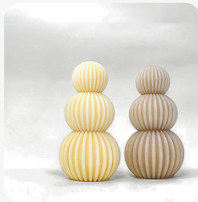
09 Goddess (6 x 12cm)

*Candles shown are in Black | Peach | Snow