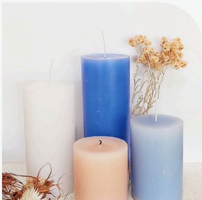
04 Pillar candle

*Candles shown are in Olive | Maroon | Black