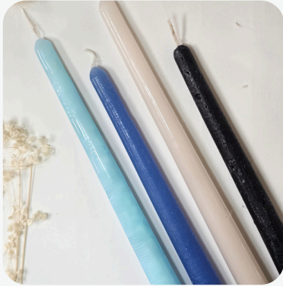
01 Tapered dinner (30cm)