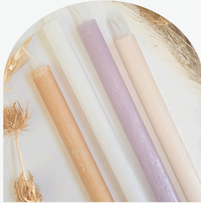
02 Dinner candle (2.2 x 30cm)

*Candles shown are in Aqua | Royal blue | Peach | Black