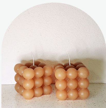
10 Bubbled bliss (5.5 x 5.5 cm)